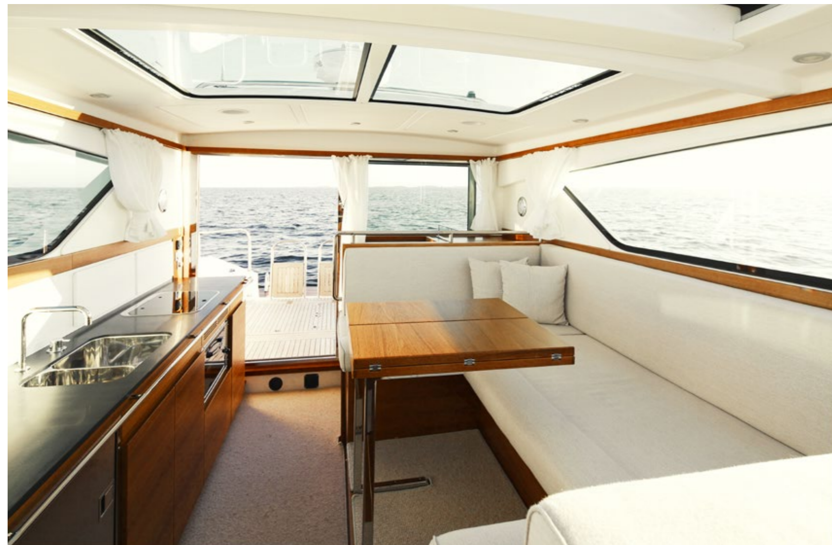
A SPACIOUS SALOON WITH PANORAMIC VIEWS, CRAFTED TEAK WOODWORK, COUNTERTOP IN CORIAN AND FITTINGS FROM VOLA.